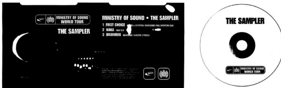
Figure 3 An example of the 3-track CD giveaway to consumers at venues as part of the 555 MOS program in 1997. 35 Dance music was an integral part of the 555/MOS Tour. Tour promotions were supplemented by these CD samplers as well as 'CD Sessions', three 1-h MOS CDs playing in HORECA outlets by local DJs to promote 555 and 'Radio Sessions', which were recorded radio DJ sessions for local stations. 35 BAT paid MOS to make this CD sampler as giveaway as well as Club Culture Guides (brochures) and branded jackets, T-shirts, baseball caps and record bags, all of which featured the 555/MOS key logo and intended as giveaways (see figure 4 for logo) 35